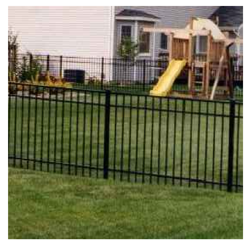
BLACK ALUMINUM DOG PARK FENCE