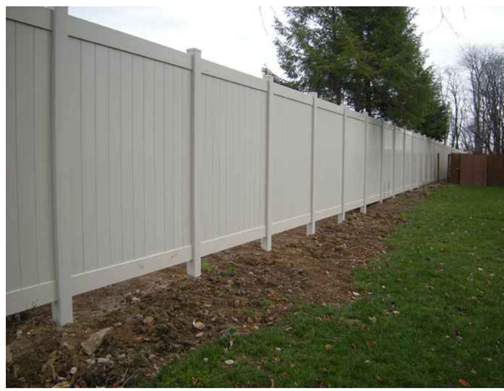
WHITE PVC PRIVACY FENCE